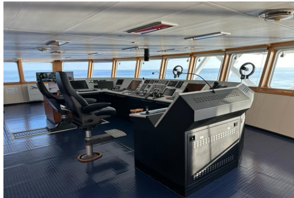
Forward Bridge Console: