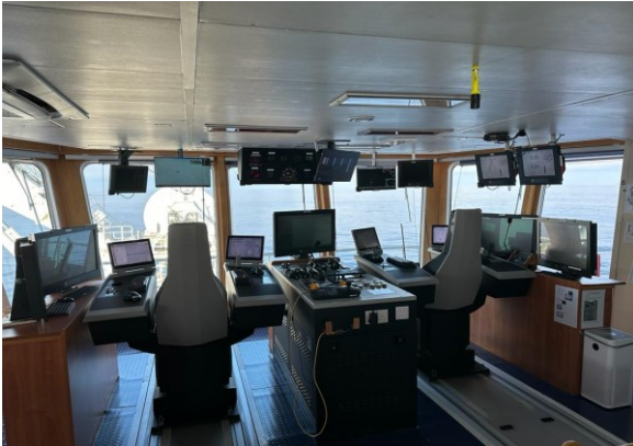
DP Bridge Control Console Aft: