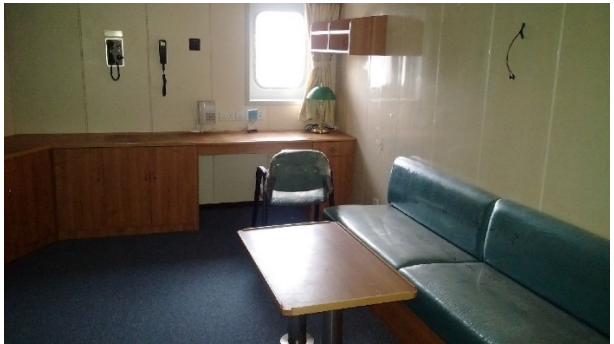
Master Day room: