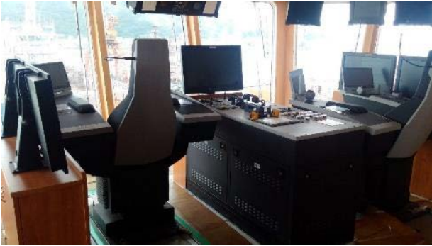
DP Bridge Control Console Aft: