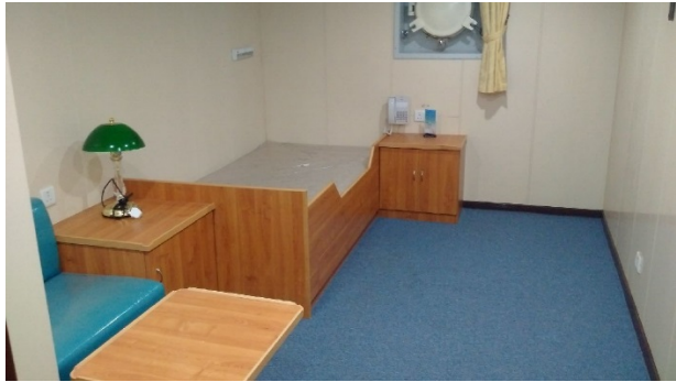
Master Suite Cabin: